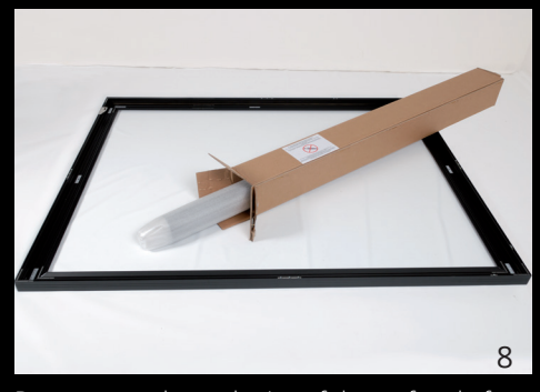
Do not open the packaging of the surface before the assembly of the basic frame is finished to avoid damages of the surface by the sharp edges of the frame profiles.