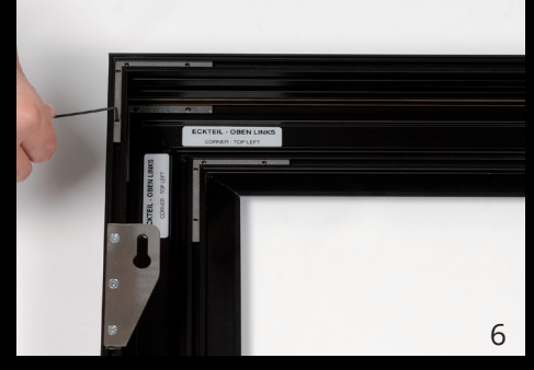
Put the frame elements together without a gap and fix them with the enclosed allen key at the hexagon socket set screws.