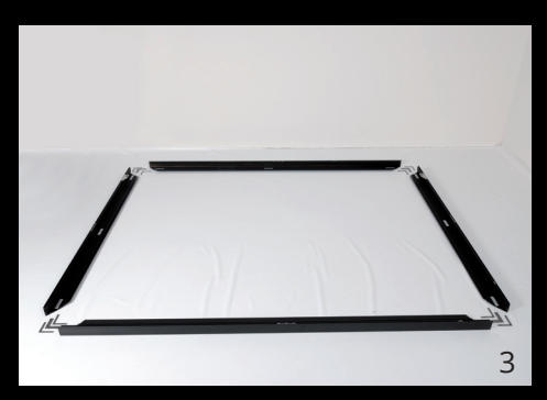
Lay out the frame elements according to the labeling as shown on the picture.