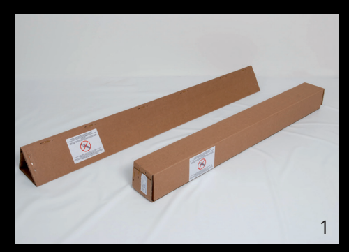
Frame elements and projection surface are delivered in two seperate cardboard boxes. Please mind the warnings on the packaging.