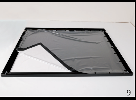
Lay out the surface according to the labeling on the backside of the surface into the frame. Take care that the ground is absolutely clean!