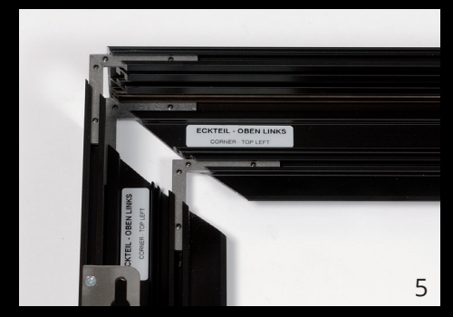
Slide in the angle brackets into the corresponding slots of the two to be connected frame elements.