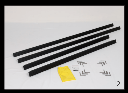
In case of more than four frame elements or center supports and horizontal strut elements Please follow the instructions under point 13-23.