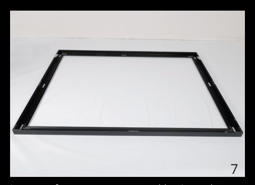
In case of center supports and horizontal struts we recommend to attach the projection surface first and then please follow the instructions under point 16-23.