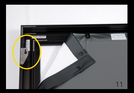
The Decoframe is mounted to the wall with its preinstalled keyhole brackets, which can be adjusted individually.