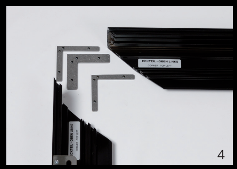
The corners are each connected with one big and two small angle brackets.