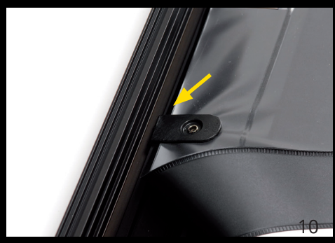
The surface is attached to the frame at the circumferential slot with its hooks.Middle struts or other support elements are mounted afterwards. See point 16 to 22.