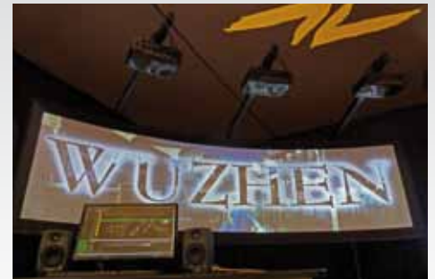
CURVE in combination with Desertscreen (three projector arms) screen size: Width 6m, Height 1,8m, Radius 6,8m

The projection screen system CURVE consists of 64x32mm plug-in frame elements with pin-connections. Vertical supports are included to eliminate horizontal deflection and to guarantee maximum frame stability. The standardized modular frame design allows for easy "no tool" assembly and comfortable transport. The CURVE is typically set up on legs, but can be optionally equipped with hanging points for "flying" installations. The projection surface comes with special designed hooks to simplify its mounting and guarantees a tight fitting to the curved frame.