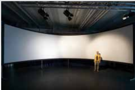
CURVE with standard ground support on legs screen size: Width 11m, Height 2,6m, Radius 4,2m

CURVE is the projection screen system for immersive technology. This modular screen system allows you to create any curve or combination of contiguous curves and flats. Use Curve for simulation, panoramic views, museum installations and countless other applications. Be inspired!