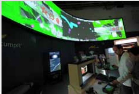
Panorama multidisplay projection on CURVE followed by a contiguous flat image area of 3.5m screen size: Width 14,2m, Height 3,2m, Radius 7m